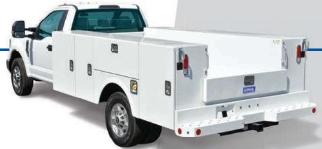
Body pictured with optional Recessed Punched Bumper with surface-mounted LED 3-in-1 Body Light Kit and Aluminum Fuel Fill