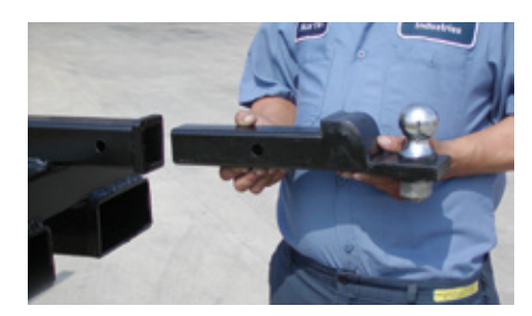
Adapter with 2" Ball Model 1391